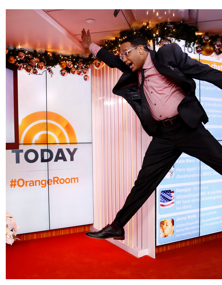
TODAY Show Contributor