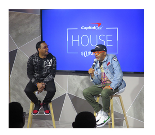
Branded Activation at SXSW 2018