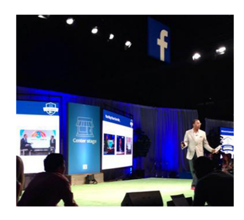
Influencer Speaking Tour