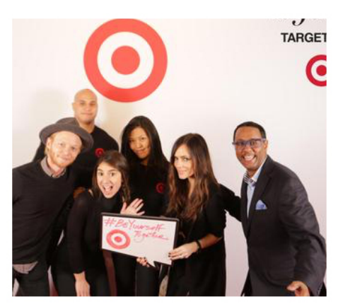
Influencer Partnership with Social Content